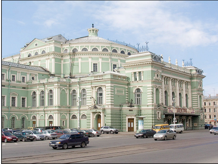
Figure 5: Mariinsky Theatre in Saint Petersburg.