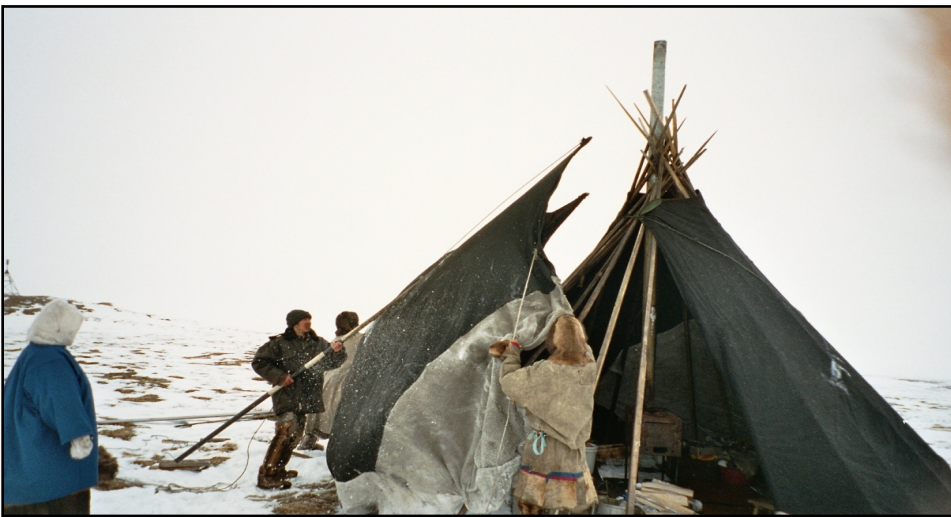
Figure 2. Setting Up a Tent after Migration in the Tundra, Nenets Autonomous Okrug, May 2006.

As settlers from farming and fishing cultures to the south populated northern Eurasia, mixed economies evolved with new activities introduced by settlers, who also adopted many indigenous practices. Settlers had to adapt their livelihoods in northern areas, with only a few groups able to sustain their previous livelihoods without substantial changes. For example, Norwegians adapted their fishing, sheep herding and dairy farming practices to climates north of the Arctic Circle, as well as to Iceland and Greenland. Mixed populations of Finnish settlers and Forest Sámi in Finnish Lapland developed a mixed economy of hunting, fishing and dairy farming alongside reindeer herding. Later, Finnish settlers to Norway, called Kvens, adopted sea fishing combined with small-scale farming. Some Sámi became farmers or combined small-scale agriculture with reindeer herding or hunting and fishing. Even nomadic Sámi had some sheep, as did some Nenets, the indigenous peoples from Russia as pictured in Figure 2.