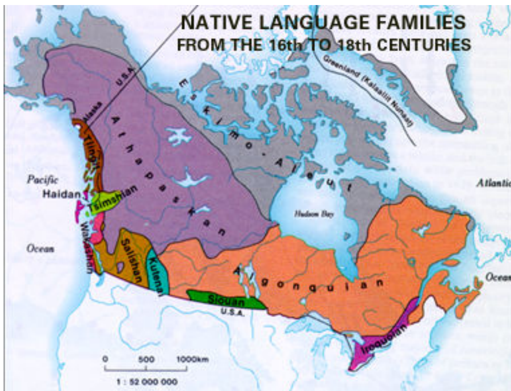
Figure 4: Canadian Native Language Families, 16th to 18th Centuries

The Canadian Constitution Act of 1982 specifies that the Aboriginal Peoples in Canada consist of three groups – Indians, Inuit, and Métis. The term aboriginal is a legal term that is entrenched in the Canadian Constitution (1982) Section 35(2) and includes Indian, Inuit and Métis (United Nations Development Program 2008). Figure 4 shows the native language families, which form a portion of the definition of aboriginal peoples in Canada.