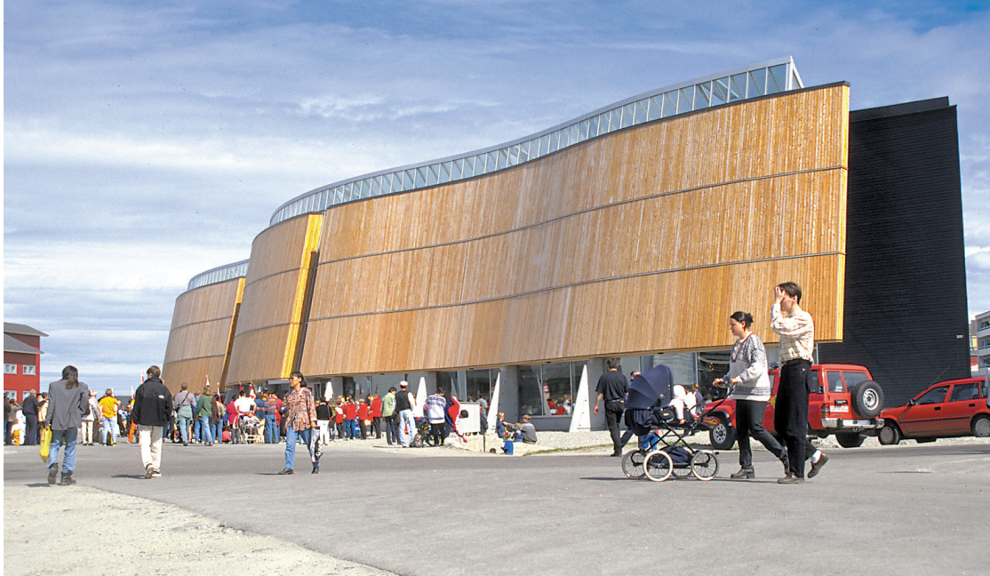
Figure 6: Katuak Cultural Centre in Nuuk, Greenland.