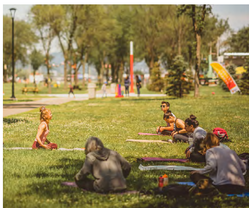
Mathieu Bélanger / ULaval