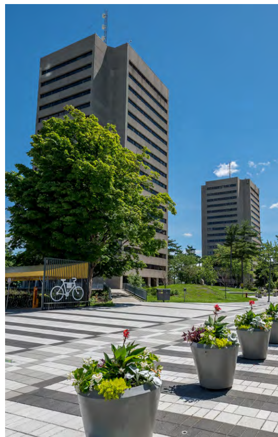
Dany Vachon / ULaval