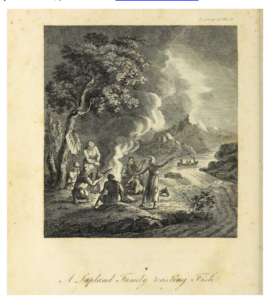
Giuseppe Acerbi: Travels through Sweden, Finland, and Lapland, to the North Cape: in the years 1798 and 1799 (II: 1802)